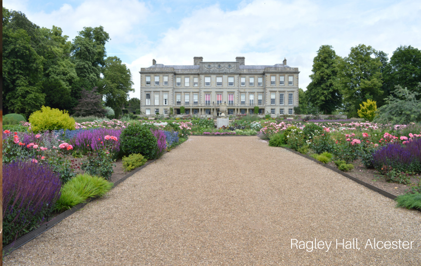
Ragley Hall, Alcester