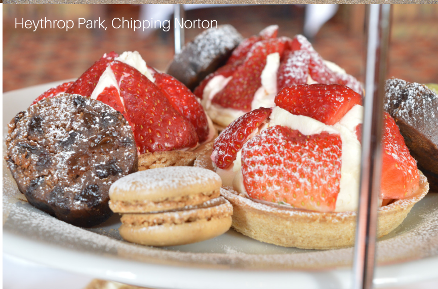
Heythrop Park, Chipping Norton

Outstanding Young Communicator 2016 CIPR PRide Awards Anglia, Thames and Chiltern