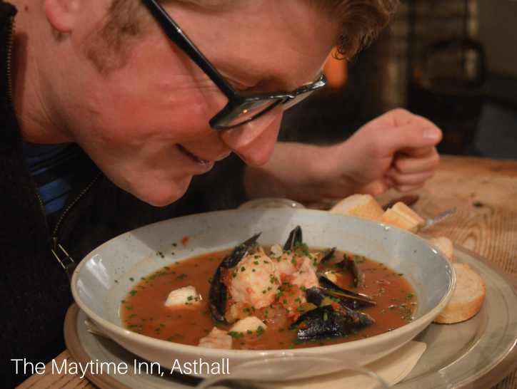
The Maytime Inn, Asthall