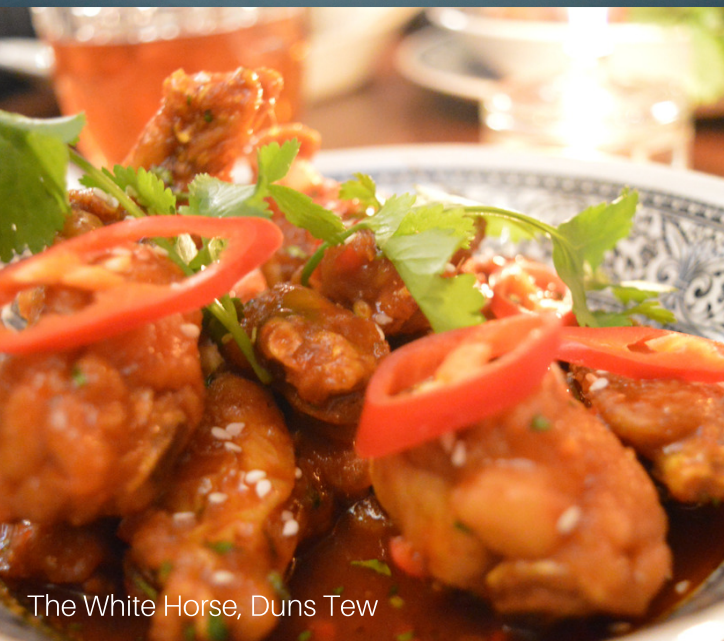
The White Horse, Duns Tew