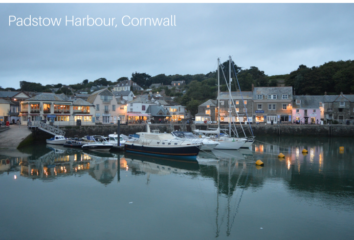
Padstow Harbour, Cornwall